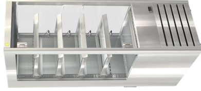
Shown with optional frame less hinged acrylic front door sold as accessory kit