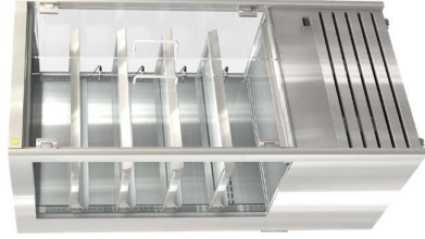
Shown with optional frame less hinged acrylic front doors sold as accessory kit